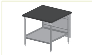
OPEN BASE WITH MILLWORK