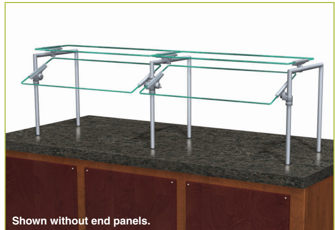
Shown without end panels.