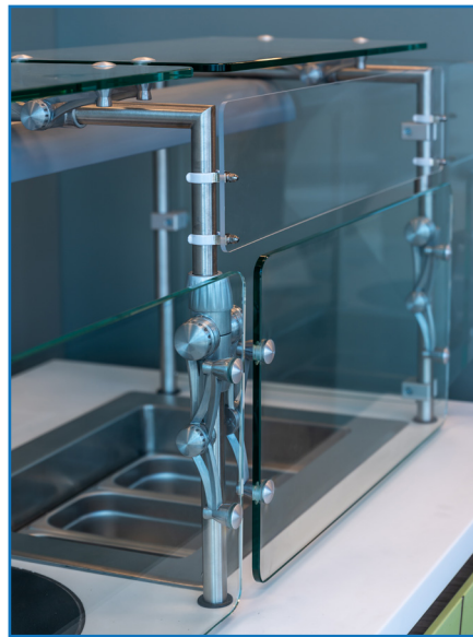
BSI-RK6 Retrofit Kit shown with XGuard. Bracket system in full-service position lowered to counter.