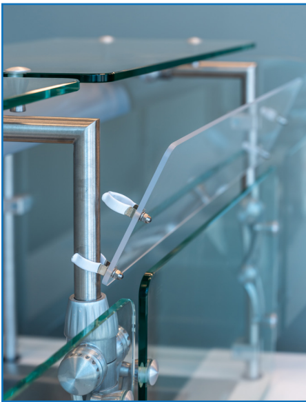
Figure 1: Simultaneously push the clips on both sides of the panel onto the existing posts.