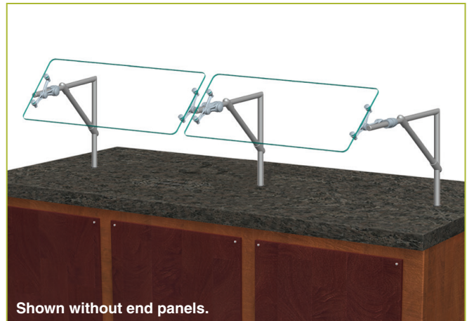
Shown without end panels.