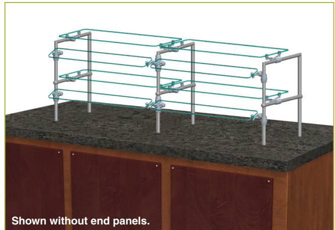
Shown without end panels.