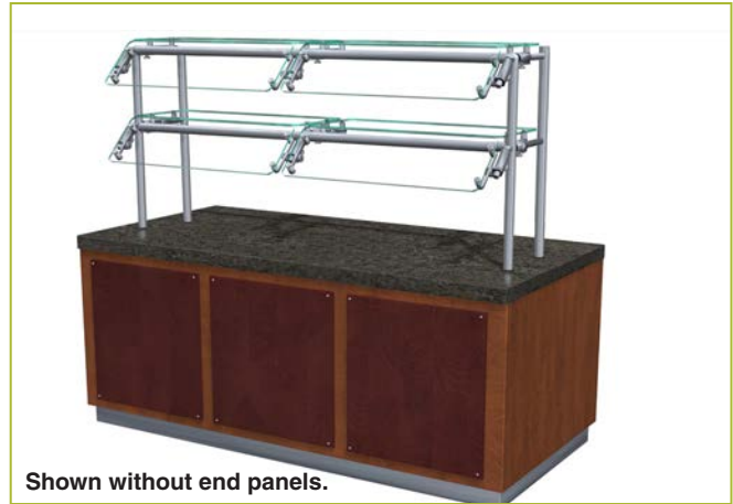
Shown without end panels.